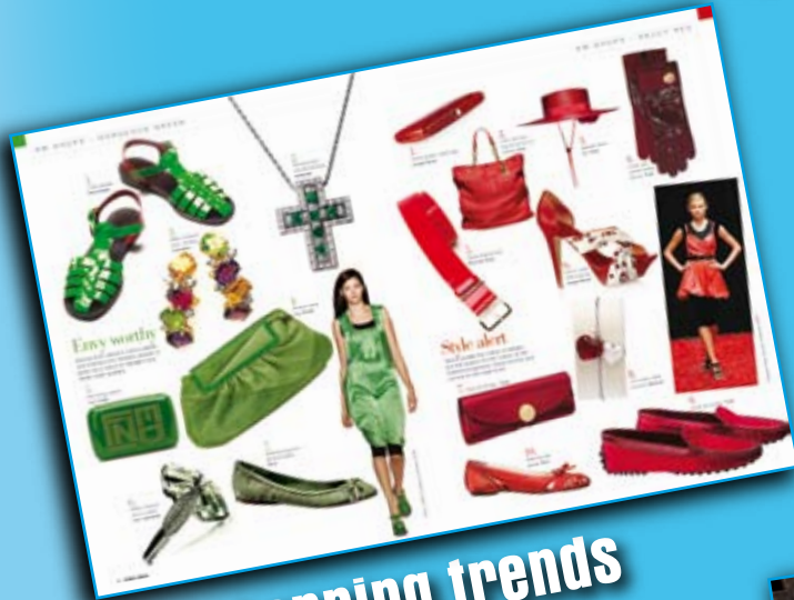
AW shopping trends